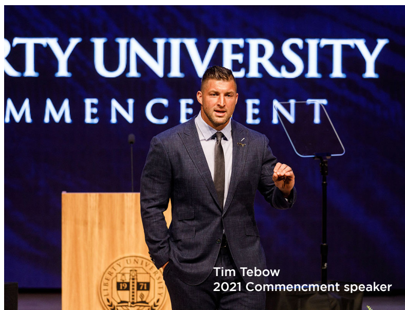
Tim Tebow 2021 Commencement speaker