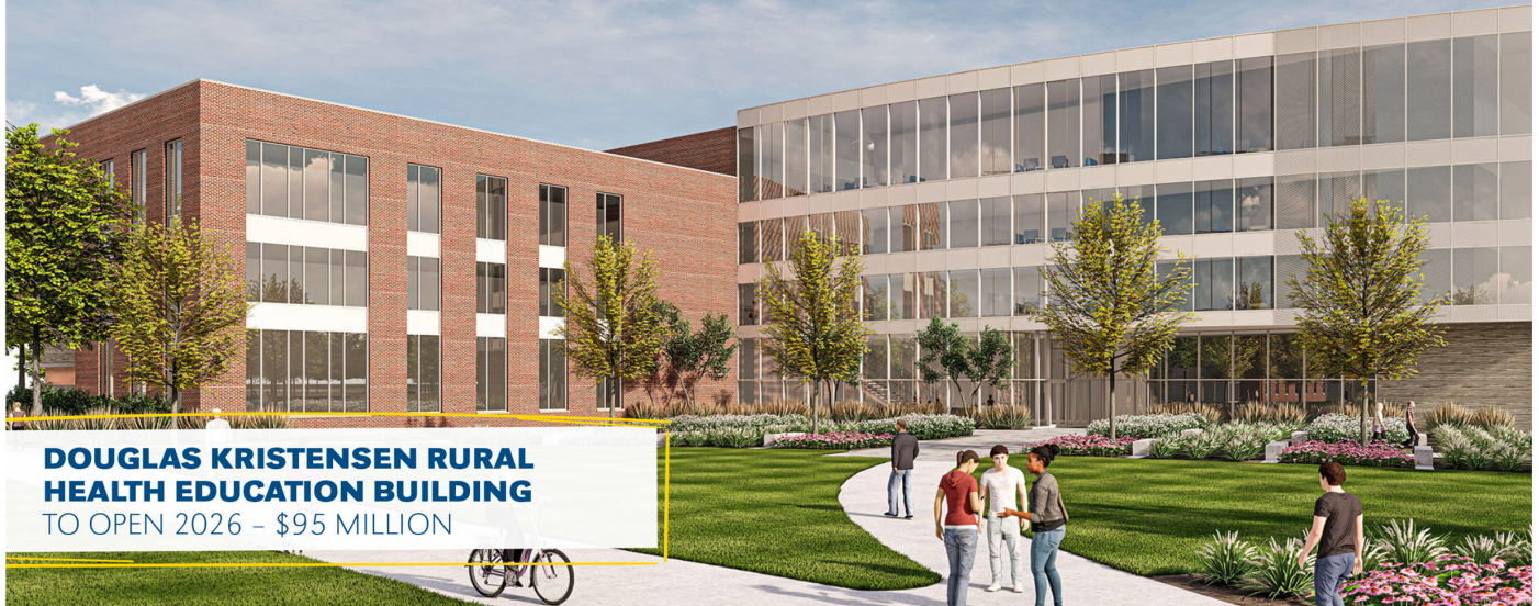
DOUGLAS KRISTENSEN RURAL HEALTH EDUCATION BUILDING TO OPEN 2026 - $95 MILLION