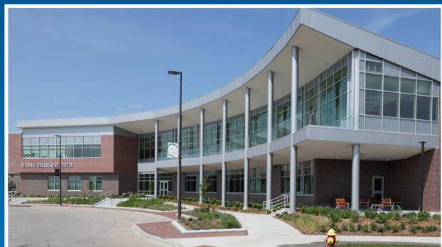
REGIONAL ENGAGEMENT CENTER COMPLETED 2024 - $15.6 MILLION