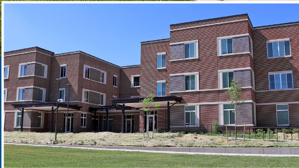
ARMSTRONG HALL – SORORITY HOUSING COMPLETED JANUARY 2024 - $32.6 MILLION (TOTAL INCLUDES FRATERNITY HOUSING)