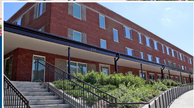
MARTIN HALL – FRATERNITY HOUSING OPENED JANUARY 2023 - $32.6 MILLION (TOTAL INCLUDES SORORITY HOUSING)