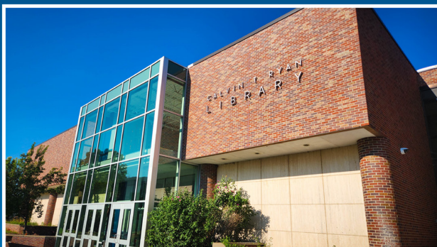
CALVIN T. RYAN LIBRARY RENOVATION COMPLETED FALL 2024 - $25 MILLION